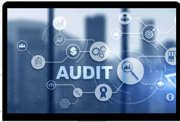
Independent Verification and Validation (IV&V)

Bovian combines technical expertise, a team spirit, and excellent customer service to be your "go to" firm for RMF and cybersecurity with expertise in: